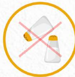
Cut down on consumption of salt in your daily diet