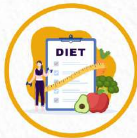
Controlled Diet (Consult dietician)