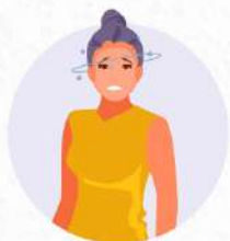
FLIES BEFORE EYES