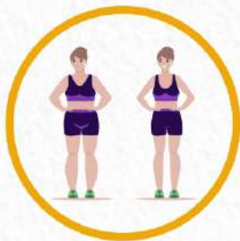
Lose excess weight

Although High BP cannot be cured, but it can be controlled. The target blood pressure is below 140/ 90. In case you have high risk or kidney disease, you must aim to maintain it below 120/80. You have to undergo some changes in your lifestyle, viz.