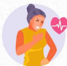
CHEST PAIN, TACHYCARDIA