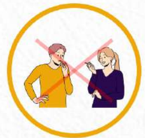
Avoid alcohol & quit smoking