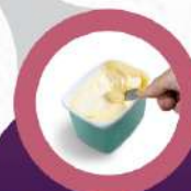
Unsalted butter & margarine